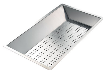
Stainless steel perforated tray