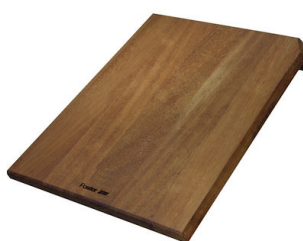
Iroko-wood sliding chopping board