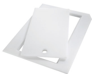
HPDE twin chopping board